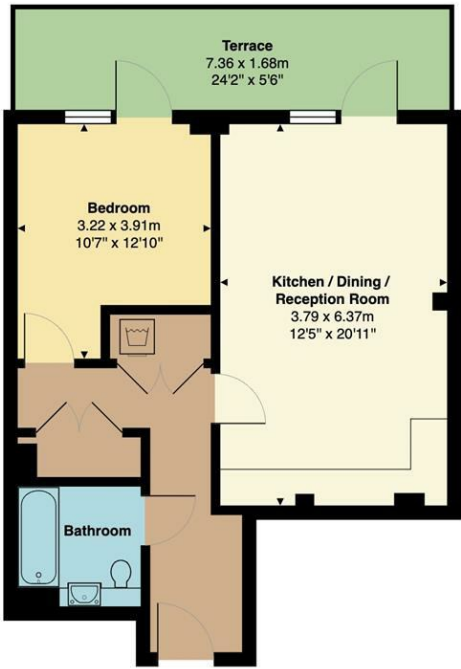
Total Area: 53.1 m² ... 572 ft² (excluding terrace) All measurements are approximate and for display purposes only

Kitchen / Dining / Reception Room 12'5" x 20'10"